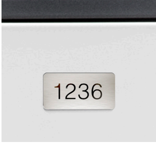
Door Number Plates