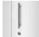
Q. Bar Pull