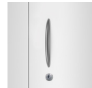
S. Satin Nickel Pull