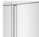
A. Full Pull